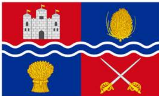
The Newbury Town Flag

More than half of the households within the town boundary are in Bands A-C and will pay less than this.