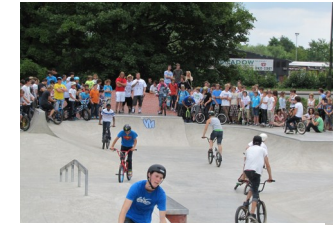
Skate Park, Victoria Park